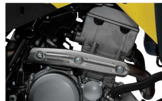
398cm 3 liquid-cooled engine