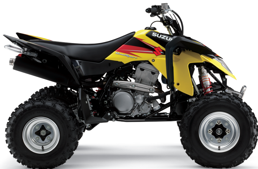
Champion Yellow No.2 / Solid Black (GY8)