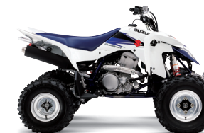
Solid Special White No.2 (30H)

Specifications, appearance, colors (including body color), equipment, materials and other aspects of the "SUZUKI" products shown in this catalogue are subject to change by Suzuki at any time without notice, and they may vary depending on local conditions or requirements. Some models are not available in some regions. Each model may be discontinued without notice. Please inquire at your local dealer for details of any such changes.