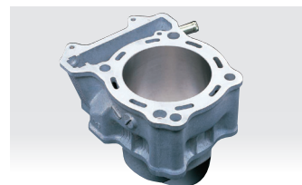
SCEM plated cylinder